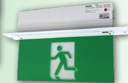
SLED W1201RM Recessed