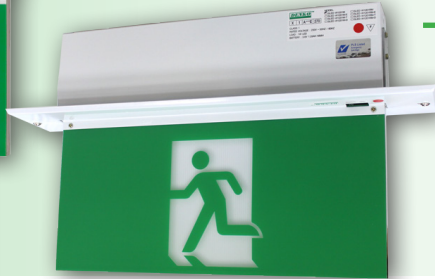
SLED W1201RM Recessed